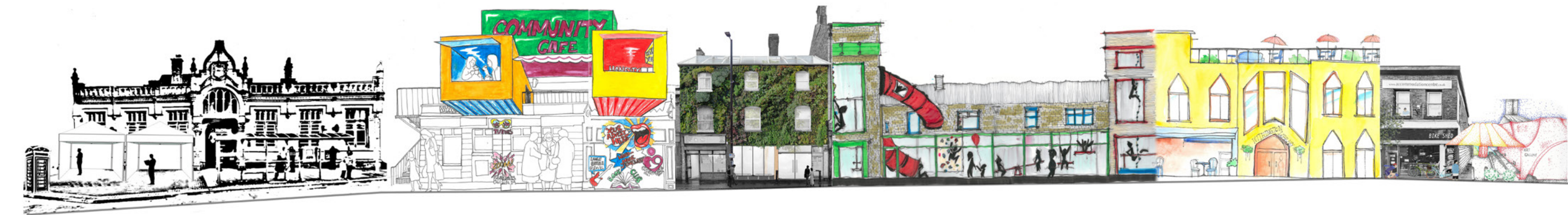
Market Community Cafe Public Winter Garden Playground Library Bike Shed Gallery