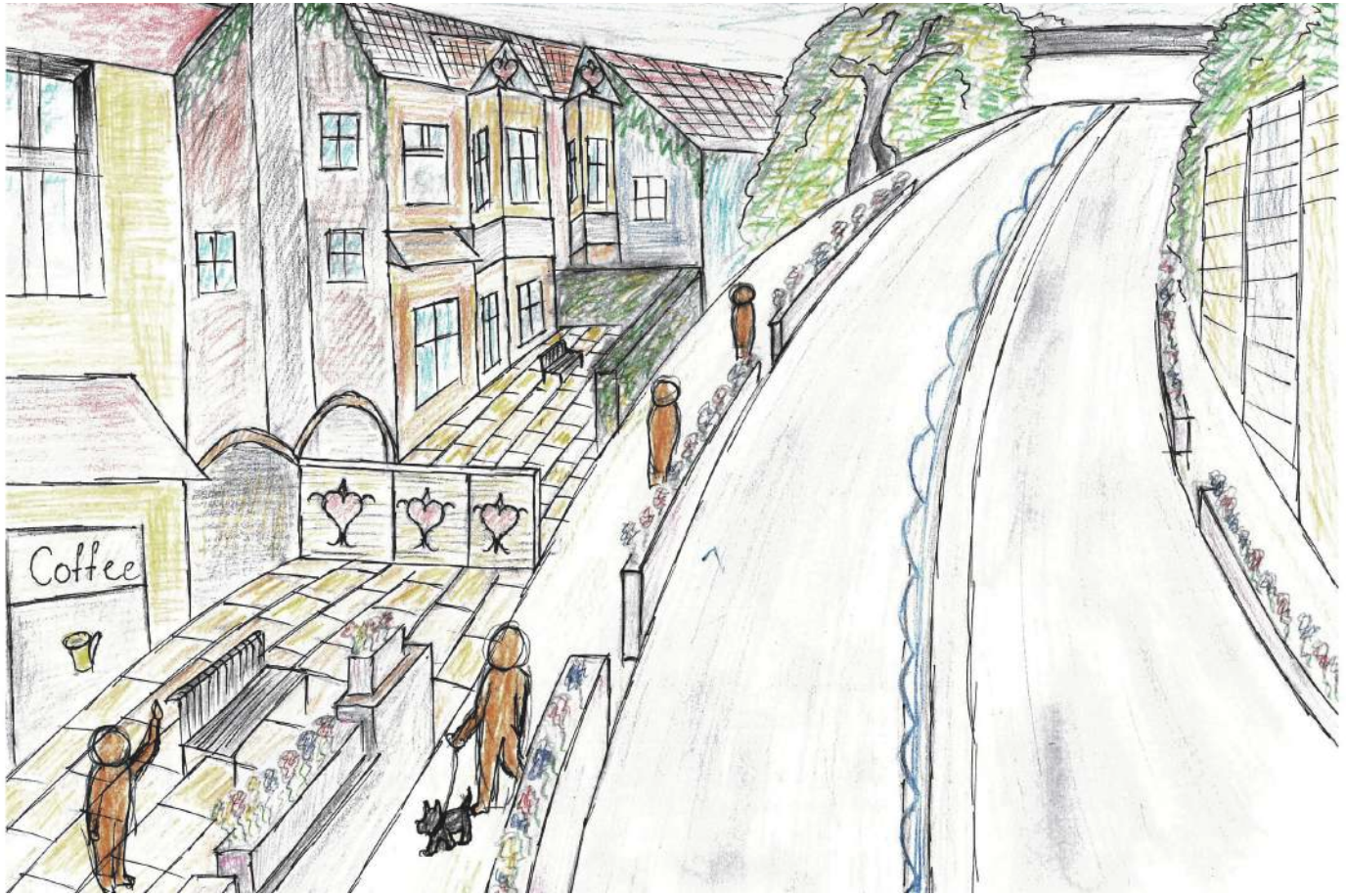
The path to River Mersey

Northenden Revival represents Palatine Road, Northenden as a journey through death, rebirth and life. Users experience this concept as they move through spaces commemorating the soldiers highlighted with the present of cobblestone hard landscaping towards a market square marked by the introduction of soft landscaping and extension of the river canal. This responds to the need of the demographic as empty derelict shops become vibrant social spaces and local organic stores replace franchise names like tesco. Pedestrian movement is encouraged as an alternative vehicular route is proposed and bike lanes are introduced to encourage a healthier lifestyle, resulting in a more attractive, vibrant street.