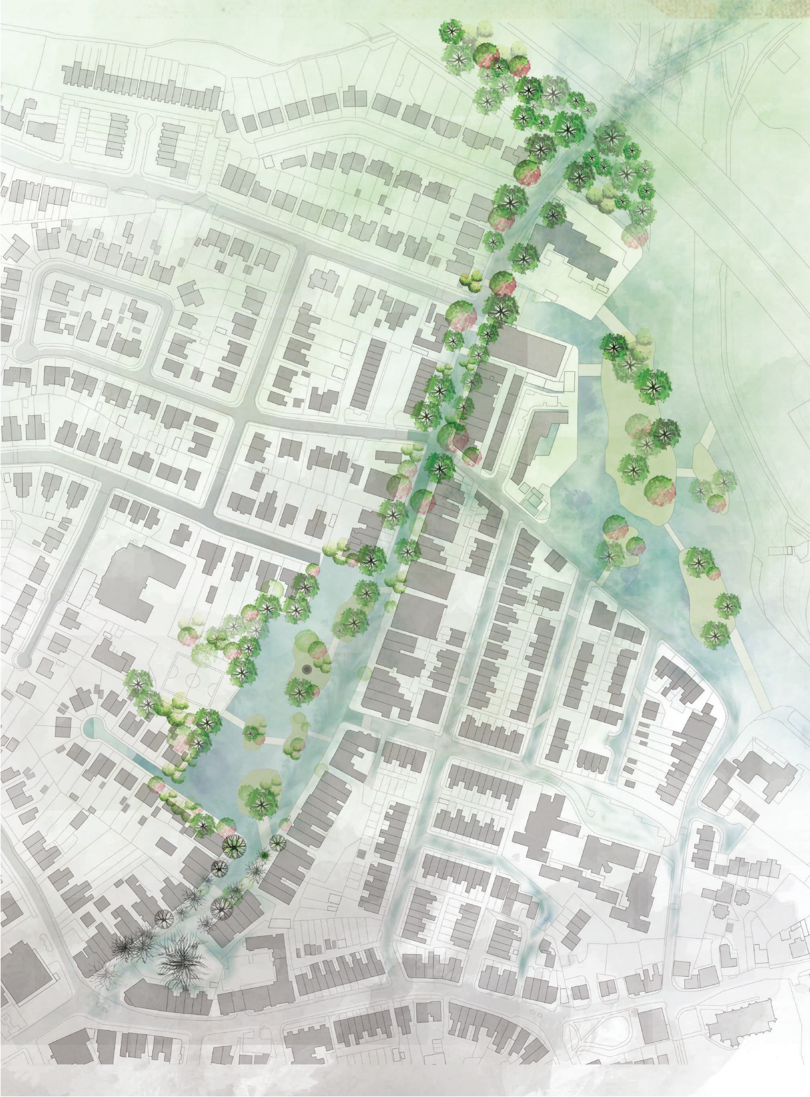
Palatine Road Regeneration Masterplan - Northenden, Manchester.