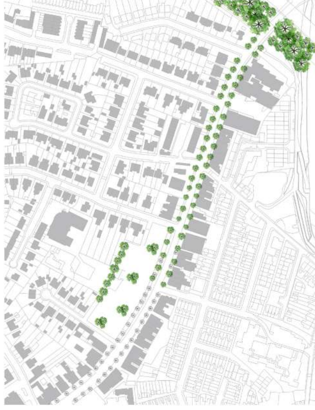
Introduction of vegetation