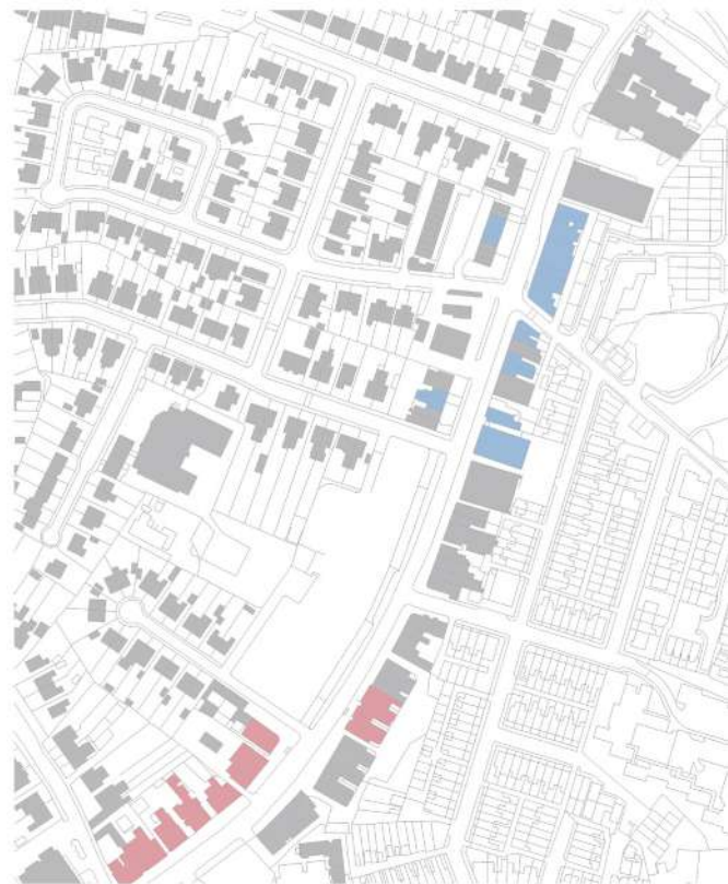
Protected derelict and proposed refurbished building elevations.