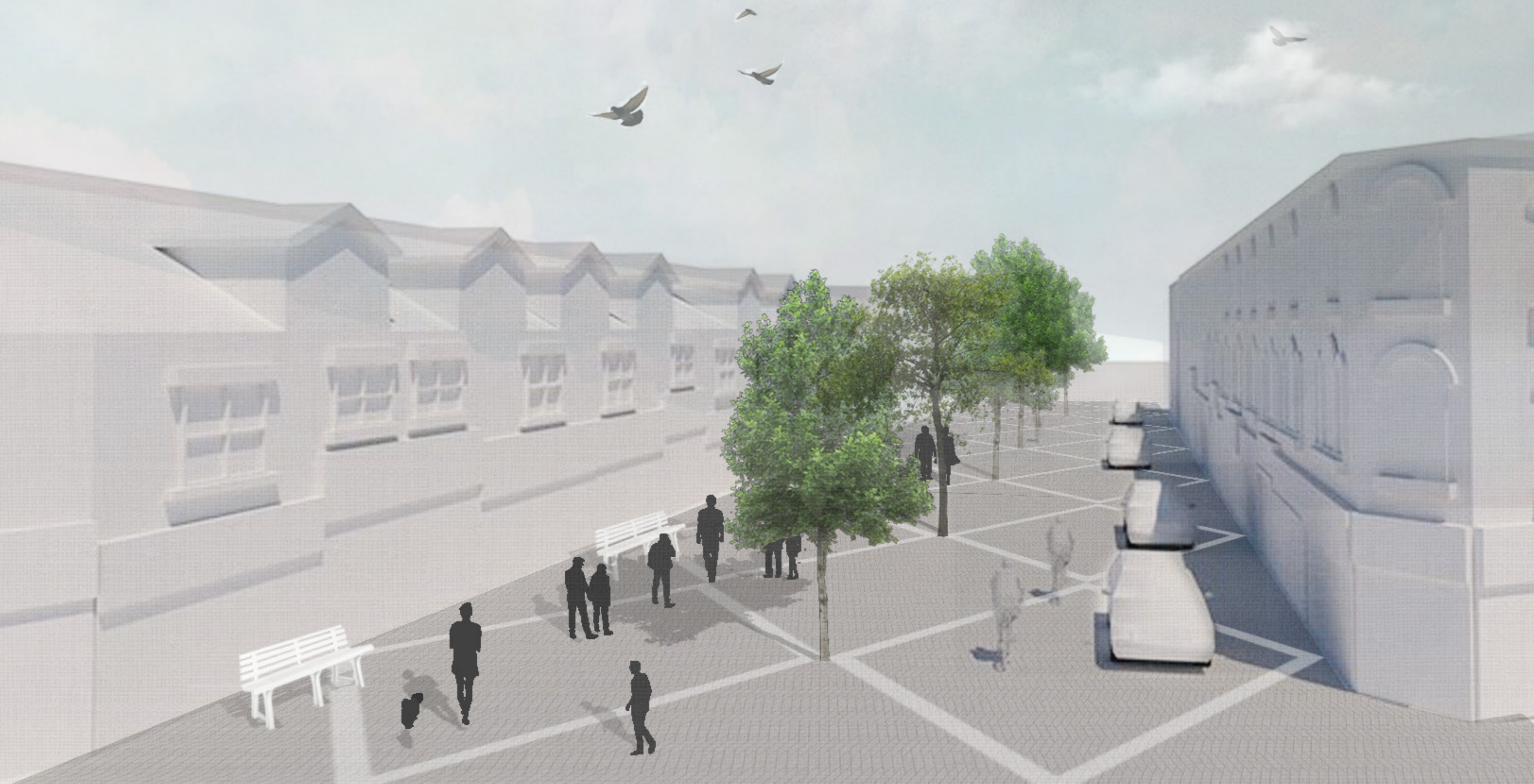
Chorlton High Street

The redesign creates a single surface for pedestrians and road users with no road markings, signs or other unnecessary furniture. The paving pattern ties in with new planting that defines the centre of the High Street. This creates a transitional zone without forming a permanent barrier where there are parking bays, cycle racks, planters and other items of street furniture.